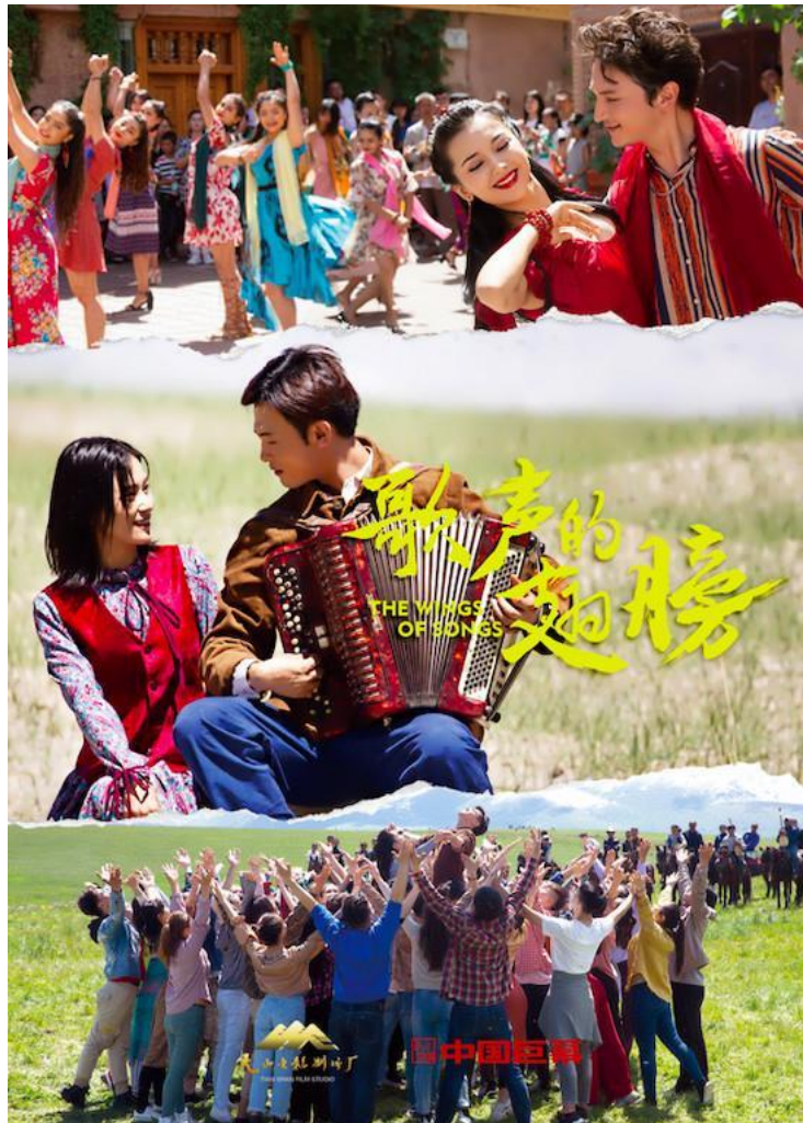
Image 2: A "The Wings of Songs" poster.

Cyberspace is an increasingly more important “ideological battlefield,” according to Xi Jinping. The introduction of the internet was a project led by the central government instead of the private sector. The government gradually upgraded its control from simply blocking foreign sites (1998), real name registration (2005~2006), to AI-driven surveillance and censorship systems operating today. Internet censorship has multiple layers, including restricted internet access (at international gateway level), technical blocking (no access to the target), search result removal (through controlling browsing company), content take-down and inducing self-censorship. The PRC employs a mix of these methods to retain ideological control over cyberspace. The earliest politically-motivated internet regulation took place in 1998, when the country first started to filter out undesirable foreign websites. The state faced challenges in terms of regulating anonymous and decentralized media, like blogging, with conventional methods. This initiative led to real name registration and localized management in the mid-2000s. Ideological control and