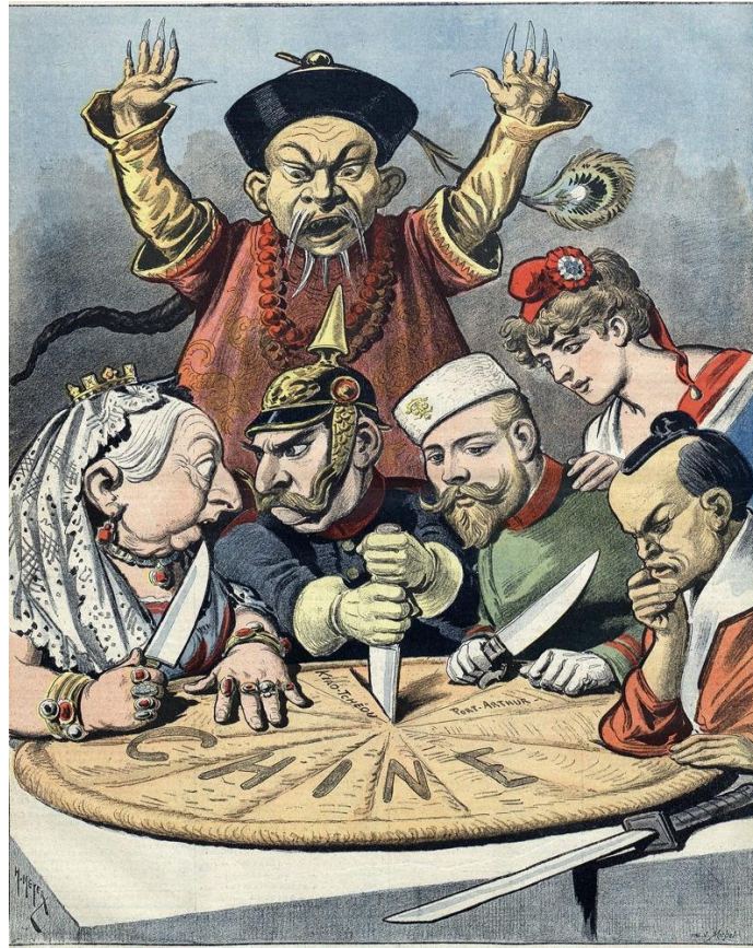
Image 1 : "En Chine. Le gâteau des Rois et. . . des Empereurs"..

questioning about China's place in the world remained as the defining characteristics of China's political thought during the republican era. 27