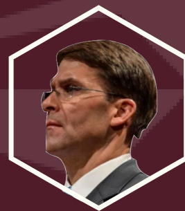
MARK ESPER ACTING U.S. SECRETARY OF DEFENCE