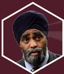
HARJIT SAJJAN CANADIAN MINISTER OF DEFENCE