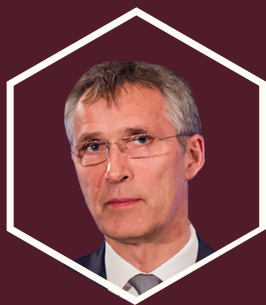
JENS STOLTENBERG NATO SECRETARY GENERAL