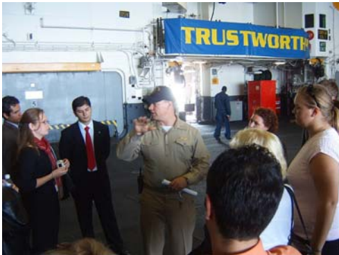
Achilles Seminar participants being briefed aboard USS KEARSARGE

The Fifty youth participants of the Rome Atlantic Forum, hosted by the Atlantic Council of Rome, discussed the future role, capabilities, and mission of NATO, in consideration of future challenges and threats. At the end of the three-day forum, participants outlined their vision for the future of NATO and produced proposals that were later circulated among the national delegations to NATO and shared with decision makers in their national capitals.